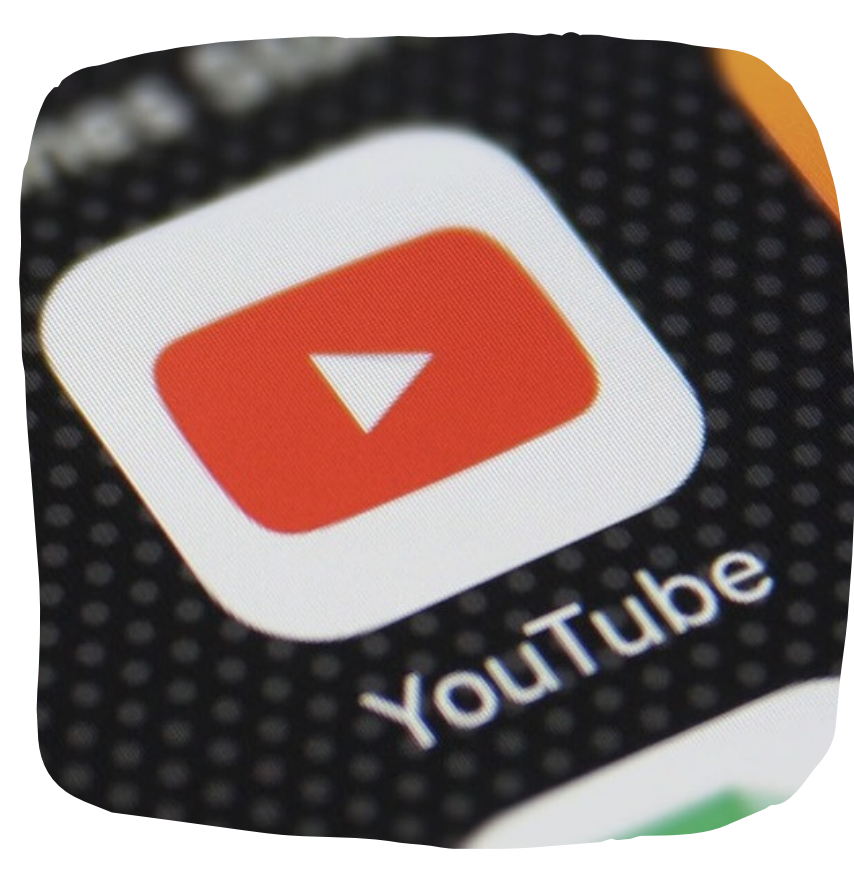
Fidgets, play a game, virtual reality, or watch a show!